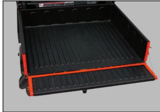
■ Plastic Cargo Bedliner