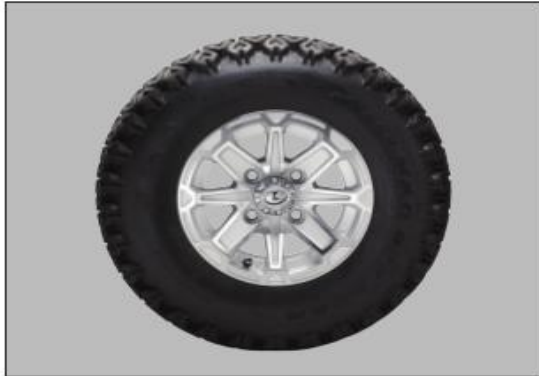
■ Alloy Wheels