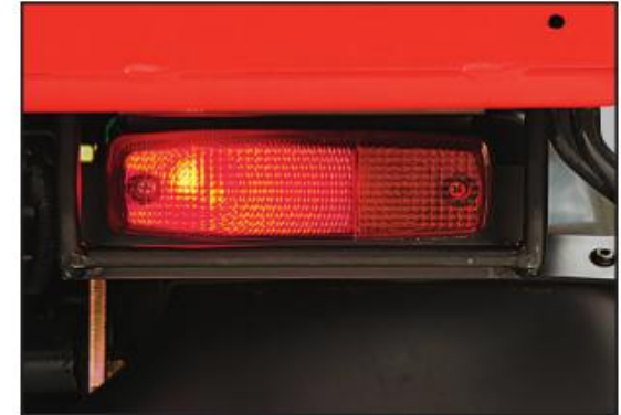
■ Tail Lamp Guard